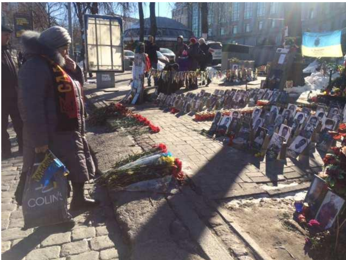
Who could have a deeper longing for peace than those grieving for their dead?

There is much argument in Kiev these days about Poroshenko, Merkel and Putin. Be they journalists, politicians, scholars, human rights advocates, or friends of mine: I have not heard anyone say that the negotiations in Minsk were completely pointless. Everyone believes that by participating, Putin is admitting his responsibility. But I have also hardly seen anyone who believes that the result will be an agreement that can be trusted. The Ukrainians are full of doubt. This is hardly surprising as since last year, since the sniper attack and the occupation of Crimea, and in spite of all the negotiations and diplomatic efforts, their lot has at no point changed for the better, but only for the worse. The doubt