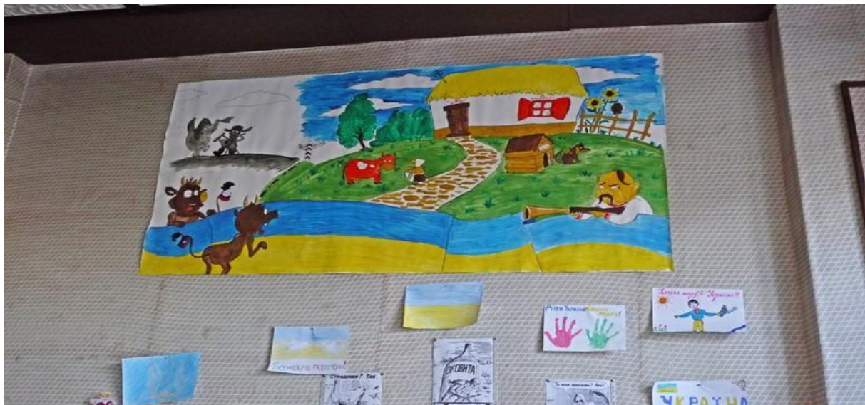
Children from all over Ukraine have painted pictures for the wounded soldiers in the hospital

In Artemivsk we head straight for the hospital, where most of the wounded from Debaltseve have been accommodated and treated.