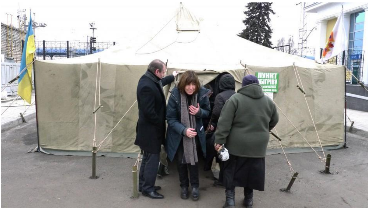
Tents have been set up to provide initial assistance to the refugee