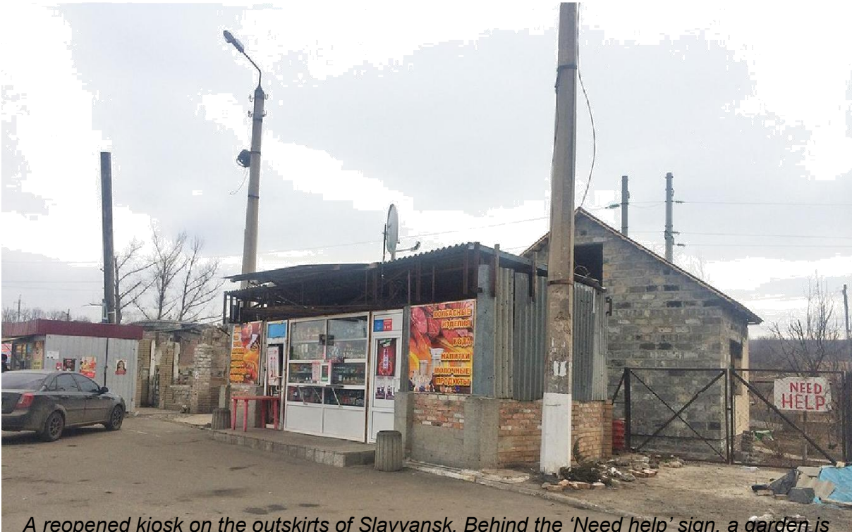
A reopened kiosk on the outskirts of Slavyansk. Behind the 'Need help' sign, a garden is being tended again

In the municipal administration building, we meet the mayor and his team in charge of the internal refugees. IDPs is the correct term rather than refugees, we are told by the members of the administrative staff. These refugees in their city are not refugees, but IDPs – internally displaced persons. Work has been done with the UNHCR people to clarify matters regarding status, rights and registration. We learn that the number of IDPs in Slavyansk, too, is very high. Many of them have been here for quite some time. And the city is making every effort to ease their situation as much as possible, even if circumstances in many cases are difficult.