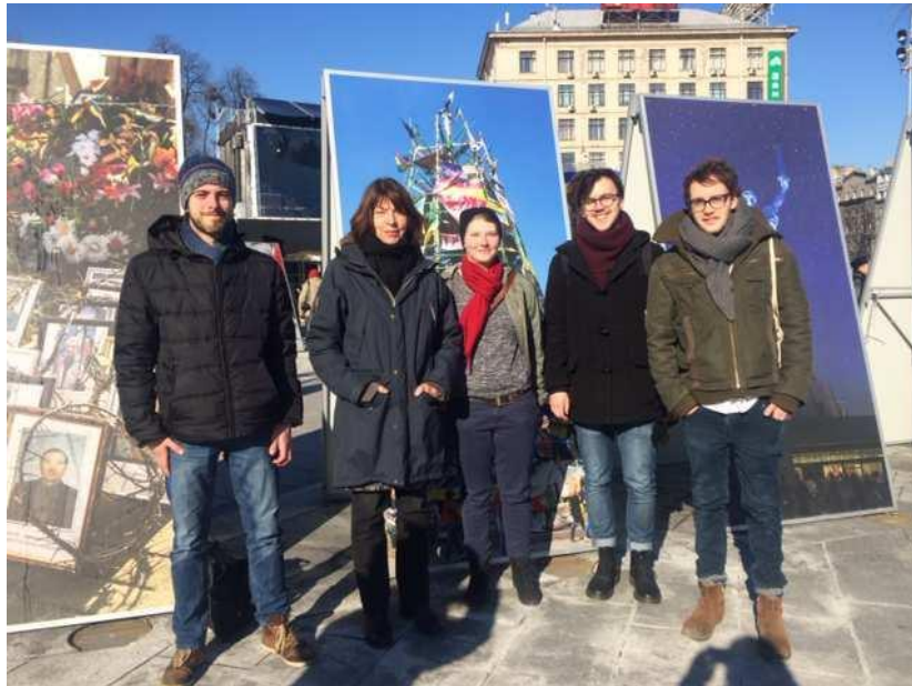
More EU Westerners need to experience Ukraine for themselves – the young people pictured here came thanks to the Erasmus programme

CIA strategies. It is a shame that only very few EU Westerners actually travel to Kiev to form their own opinion. The determination of the Ukrainians to finally work their way out of the debris of the Soviet Union and out of the unjust, oligarchical system which was erected on this debris, can be felt everywhere here. Of course, it is the young generation who want it the most.