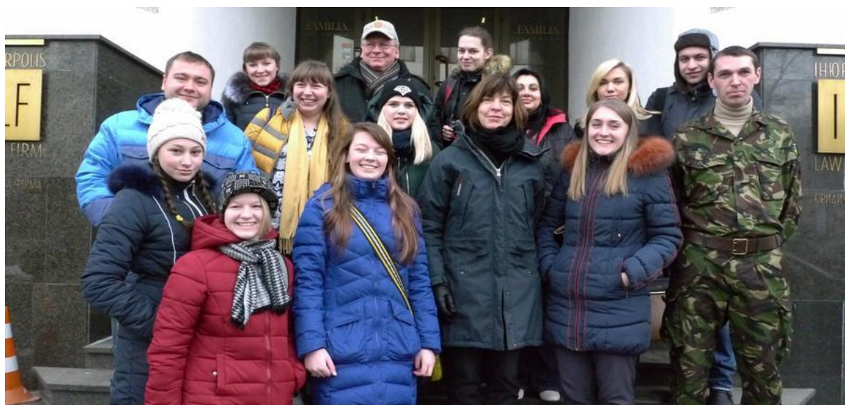
After the debate with pupils, teachers and soldiers in Kharkiv

Everything is taking a long time, I am told. Changes are being made much too slowly. But the conversations also convey a sense of the strain which the war is putting on everyone. Although the city has large volunteer organisations, these will not be able to replace non-functional state institutions in the long run.