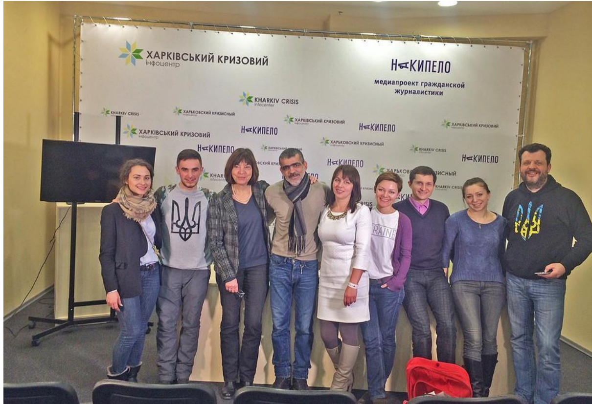
My fantastic friends from Kharkiv at the local Crisis and Information Centre

A change of location. After spending two days in Kiev, I arrive in Kharkiv. The small NGO “Kiev Talks” is represented not only in Kiev, but has set up small branches in other Ukrainian cities as well. They have helped to prepare my visit. First, I debate with various volunteer organisations, with soldiers, students and teachers.