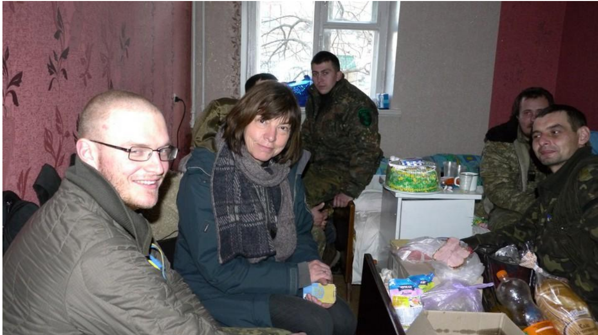
These doctors and soldiers were deployed in Debaltseve for 140 days

The medical officer who heads the battalion's team of medics speaks with us in his office. He, too, is full of praise for the assistance provided by the volunteers. But he is aware of the divisive atmosphere in the city. In his view, the war has intensified the tensions that have always existed. He says that right now it is 60 to 40 in Kiev's favour, but things are still difficult. For him it goes without saying that one would stand and fight for one's country and resist an invasion. If there were a chance for a truce, however, he would certainly use it.