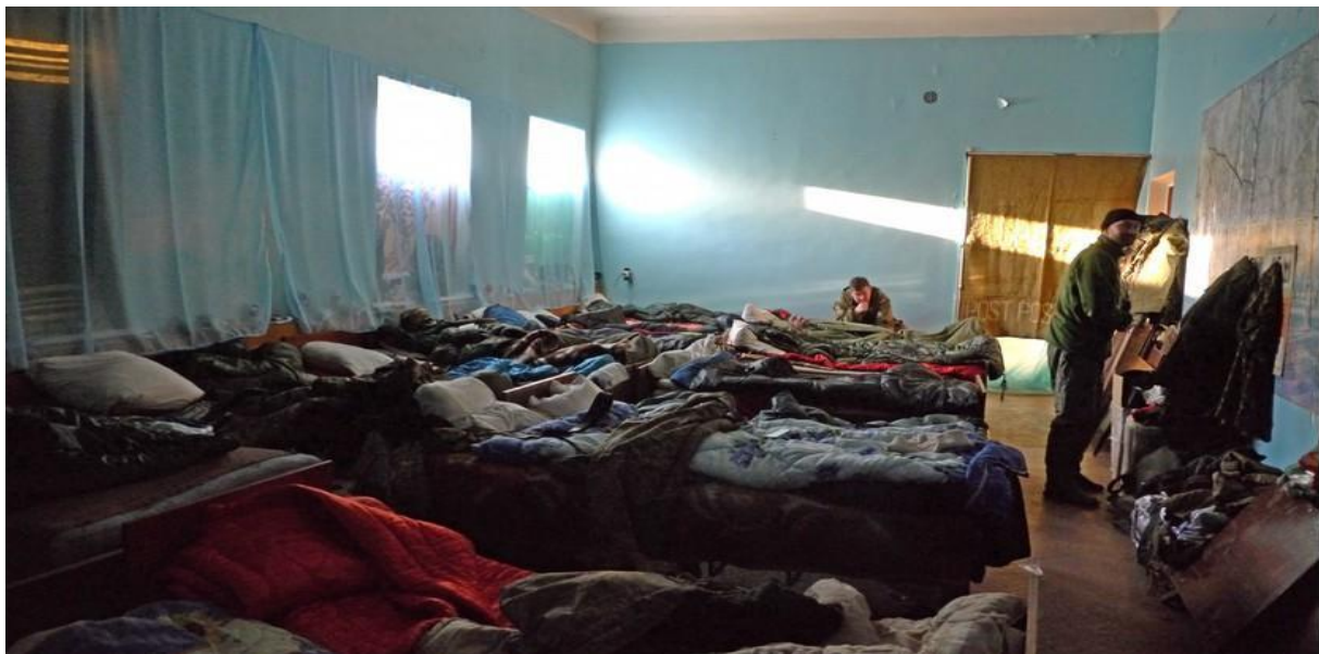
Many of the cold, damp rooms are jam-packed with beds and a ragtag assortment of sheets and blankets

The battalion pharmacist shows us his inventory. At the moment he has everything he needs. But none of his supplies were provided by the state, he says. All of it came together through donations and the efforts of volunteers. Great pride is taken in the volunteers and their tremendous support for the soldiers. The question about the role of the state is not voiced aloud, yet it looms large throughout the entire tour of the facility.