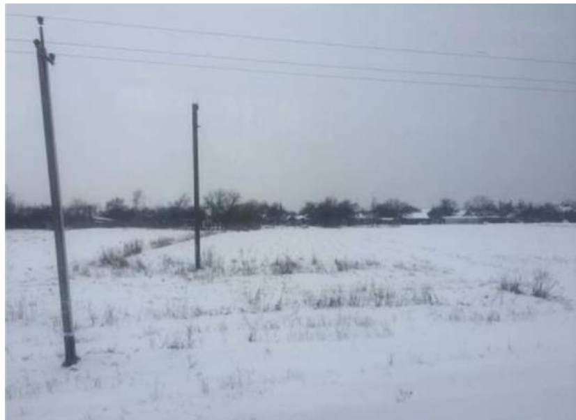
Travelling to the east