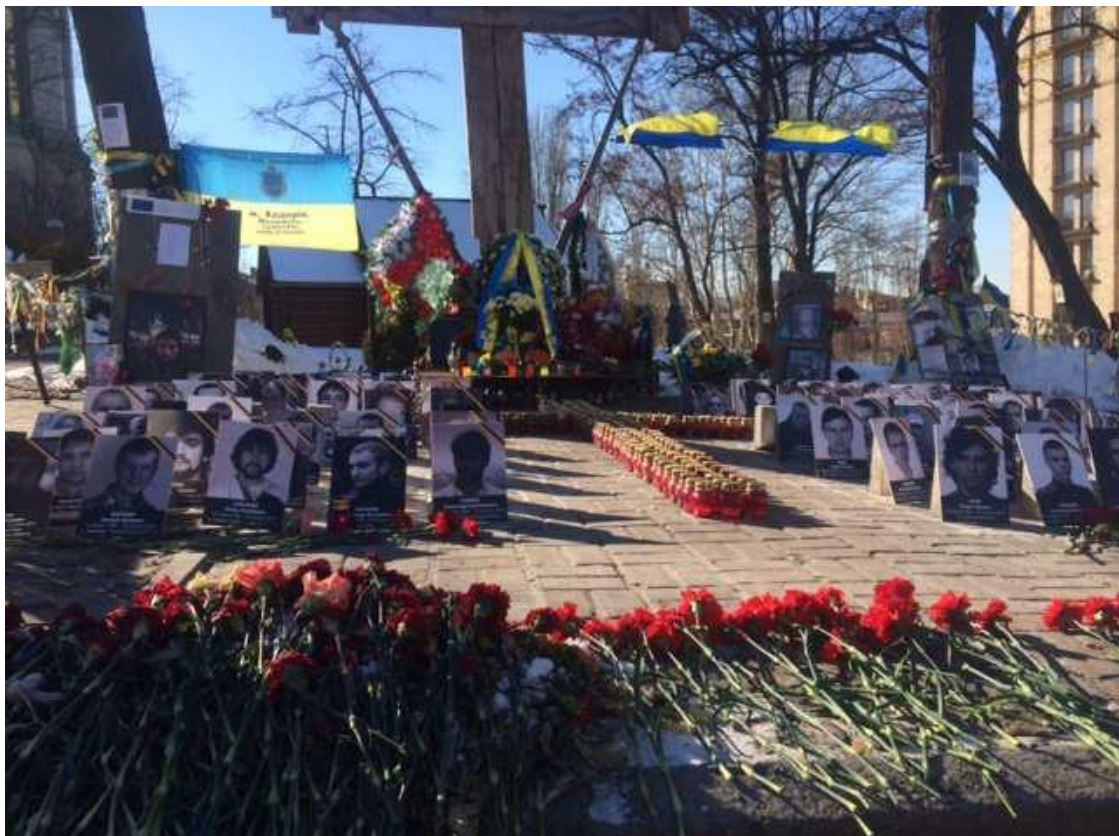
Downtown Kiev remains a place of mourning and remembrance

It has not been possible to keep expectations low regarding a successful outcome of the Minsk negotiations with Vladimir Putin, despite the fact that Angela Merkel and François Hollande as mediators did their best to keep them to a minimum. But anyone following the developments of the war in the Donbas can only hope for success and for the fighting to stop. It has been a year since the violent response to the Euromaidan movement came to a preliminary halt following the murderous deployment of snipers. The one hundred dead are being remembered in Kiev these days. Yet the mourning for the sniper victims on the Maidan, the memories of Yanukowich fleeing and of a new beginning being made in the Verkhovna Rada, are being diluted by more bad news coming in from the east of the country four days after the official starting date of the ceasefire. The conflicting reports on the citizens and Ukrainian soldiers surrounded in Debaltseve are the subject of virtually every conversation. It is hard to be optimistic.